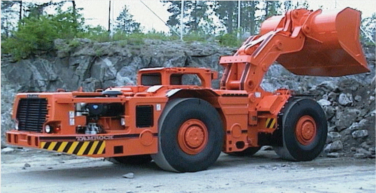
Productivity and Security